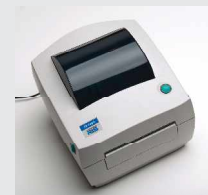
Optional Report Printer P/N: 002-9018 (110V) or 002-7181 (220V)

Inspector™ is a registered trademark of RJS Technologies, Inc. in the United States and/or other countries