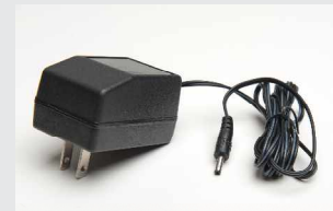
Optional Battery Charger P/N: 002-1425 (110V) or 002-1617 (220V)